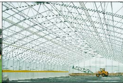
STORAGE BUILDING (LOGISTICS)